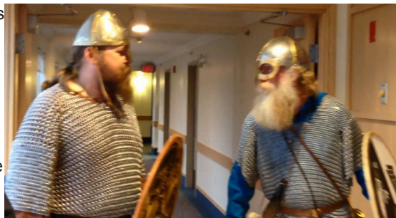
Vikings looking for plunder