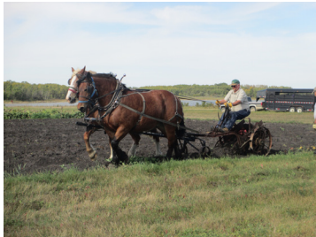
Horse drawn potato digger

A large garden was planted at the museum site with over 2,000 hills of potatoes as well as other vegetables such as beets, carrots, onions, pumpkins, and squash. In July PMRM held a special event with horse drawn carriage rides and tours as well as a horse drawn scuffer to weed and hill the potatoes in our garden. The garden was looked after by volunteers with help from our summer students.