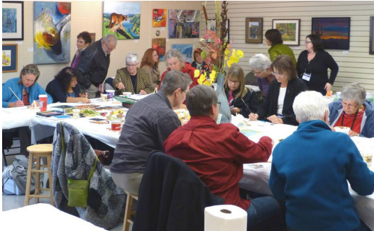
Enjoying the Gimli Art Club

This year's conference was held from October 3 rd to 5 th in Gimli. The weather may not have been ideal, but the conference was fantastic.