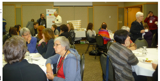
Taking a health break and visiting the trade show

Next year's conference is being planned for the Parkland region. Hope to see you there!